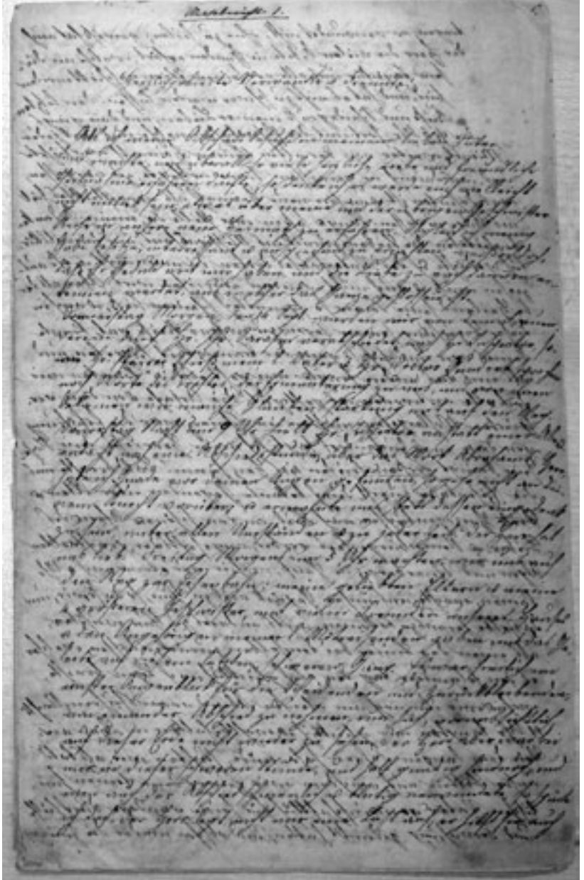
Diary (Basel Mission Church Archive, Basel Switzerland) 11