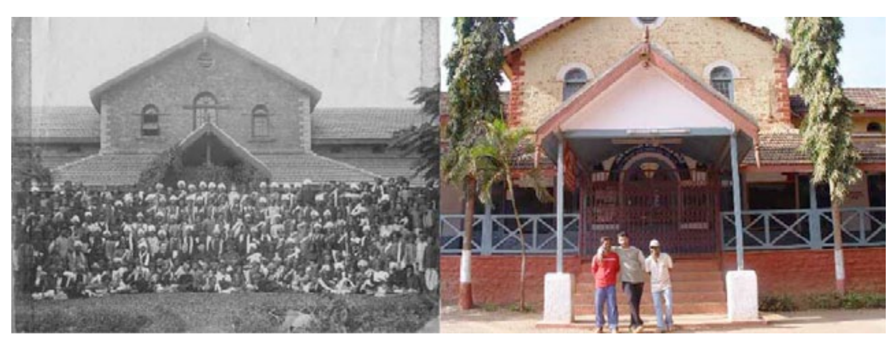
Dharwar, 1895 Dharwar, 2008