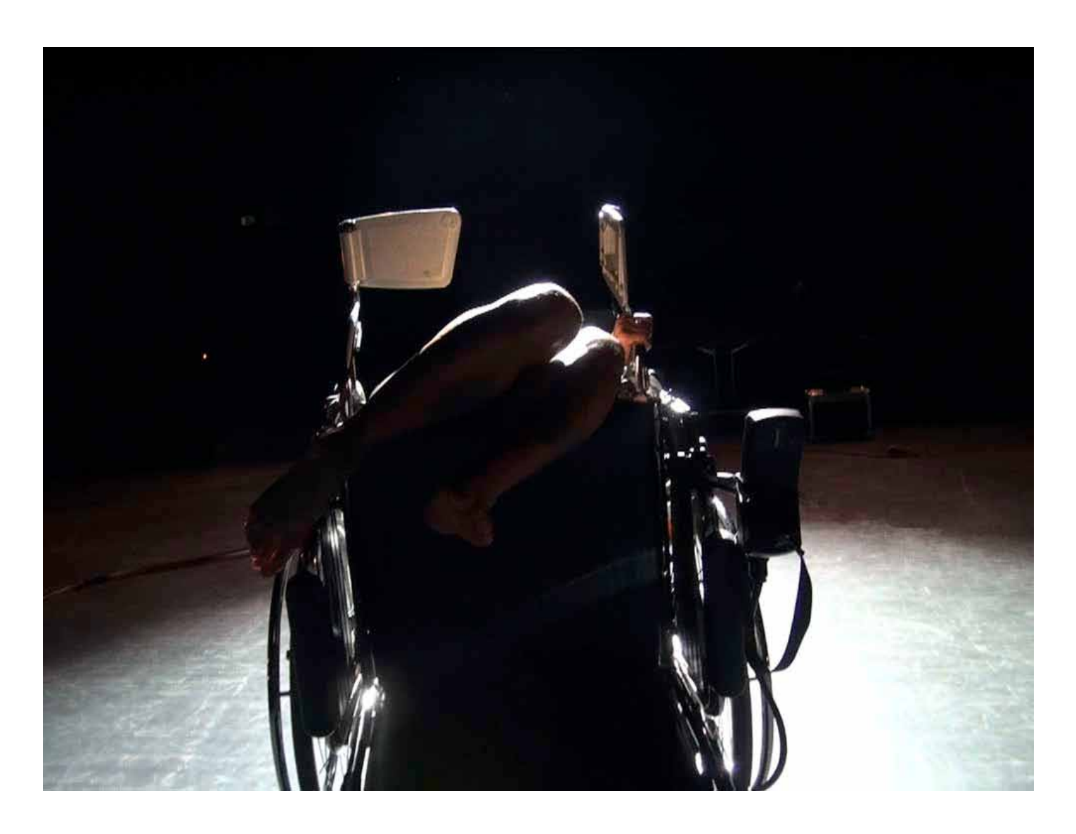
interactive dance performance / installation by Chris Ziegler